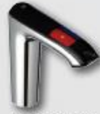
RADA DIGITAL FAUCET

Digital hot water temperature control that delivers unparalleled accuracy, stability and safety to mitigate the risk of Legionella and scalding.