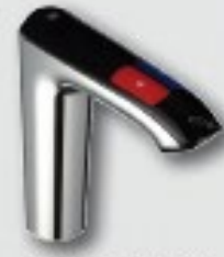
RADA DIGITAL FAUCET

Digital hot water temperature control that delivers unparalleled accuracy, stability and safety to mitigate the risk of Legionella and scalding.