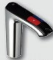
RADA DIGITAL FAUCET

Digital hot water temperature control that delivers unparalleled accuracy, stability and safety to mitigate the risk of Legionella and scalding.