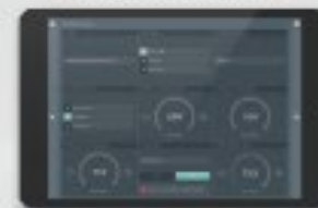
SAGE ® MONITORING