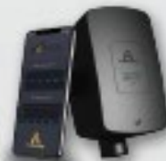
THE BRAIN ®