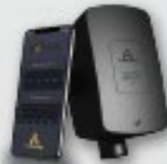
THE BRAIN ®