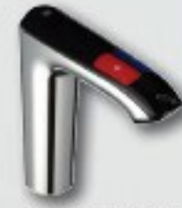
RADA DIGITAL FAUCET